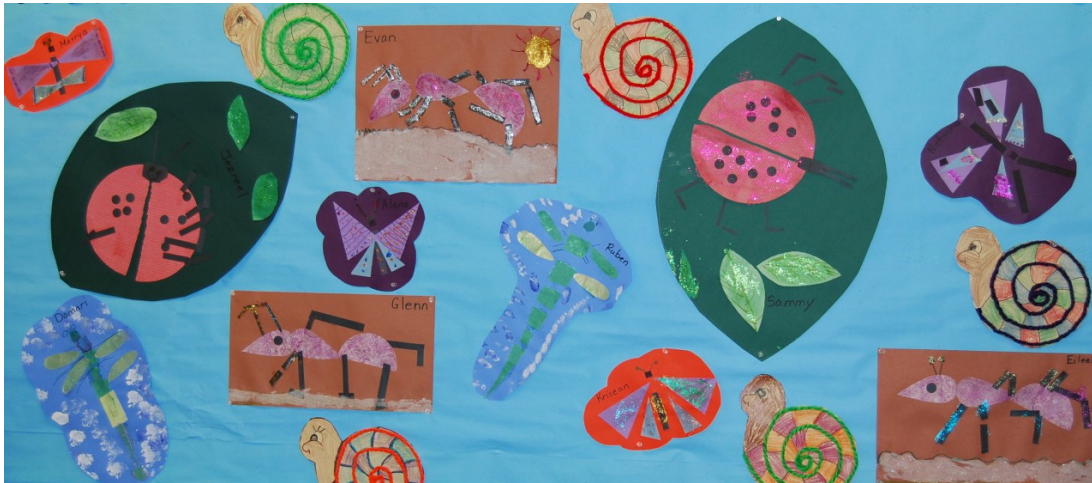
Figure 1. Insects and Flowers

Kindergarten students identified characteristics of complex flowers and insects by creating illustrations using patterned geometric shapes.